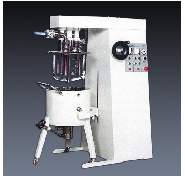
PMS Mixer by Manually Lifting