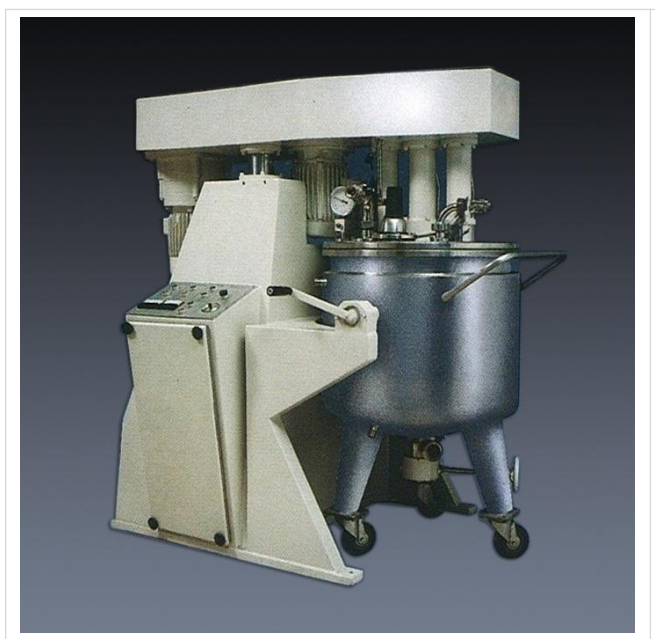
PMS Vacuum Mixer with Movable Vessel