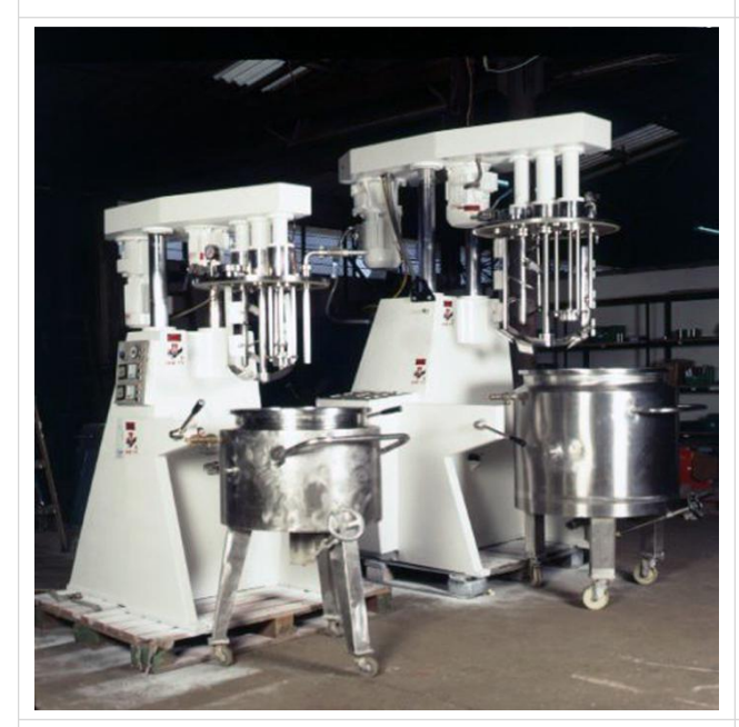
PMS Vacuum Mixer with Lifted Mixing Tools