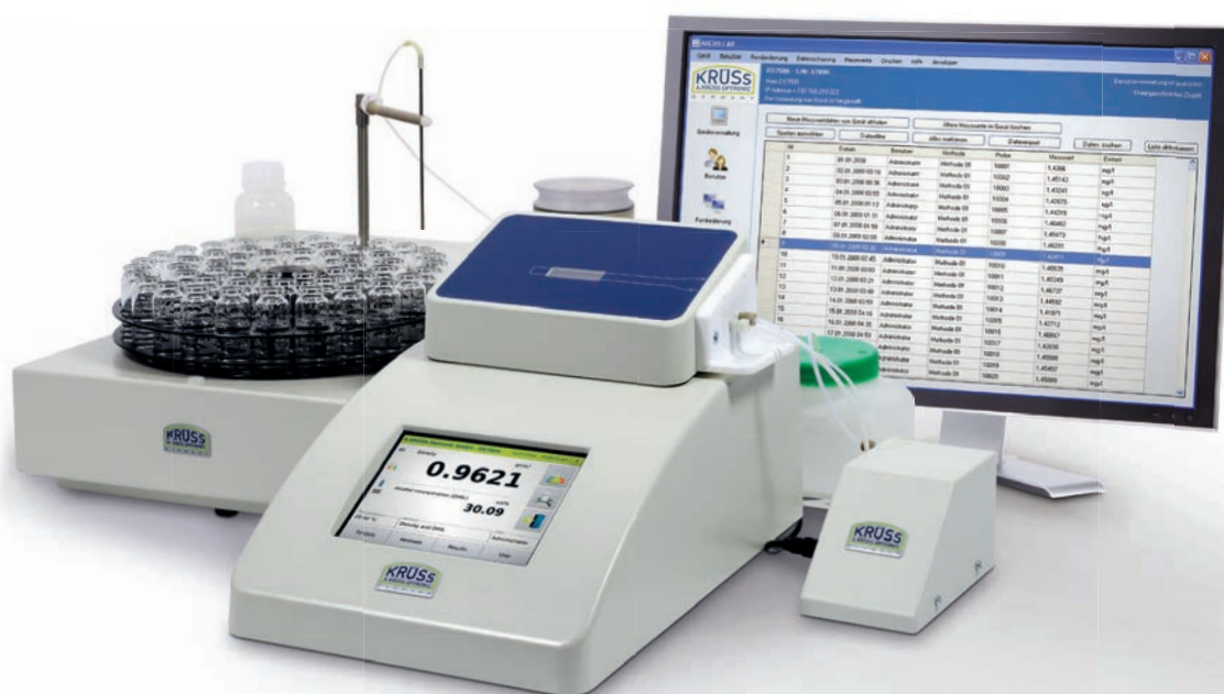
Fully automatic sample supply via autosampler AS90