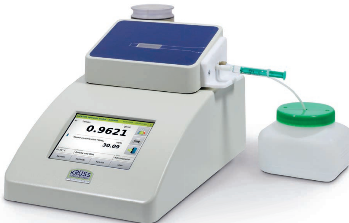
Manual sample supply via syringe