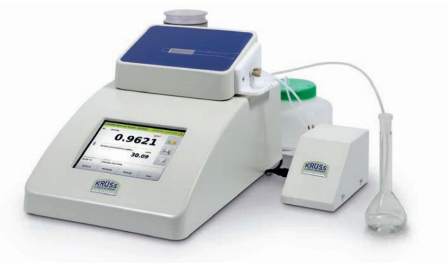
Semi-automatic sample supply via peristaltic pump DS7070

Together with the peristaltic pump DS7070, the AS80 and AS90 autosamplers allow for a fully automatic process. The samples on the autosampler's rotating plate are removed successively by the suction needle and drawn into the U-tube oscillator by the peristaltic pump. If desired, the system can be automatically rinsed and dried after each measurement.