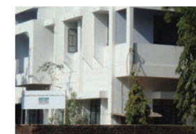
Russell Finex Pvt Ltd. New Delhi, India.

Russell Finex Inc. 625 Eagleton Downs Drive, Pineville, North Carolina 28134, U.S.A. Tel: +1 704 588 9808 Fax: +1 704 588 0738 Email: sales@russellfinexinc.com