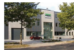
Russell Finex N.V. Mechelen, Belgium.

Russell Finex Limited. Russell House, Browells Lane, Feltham, Middlesex TW13 7EW, England. Tel: +44 (0) 20 8818 2000 Fax: +44 (0) 20 8818 2060 Email: sales@russellfinex.com