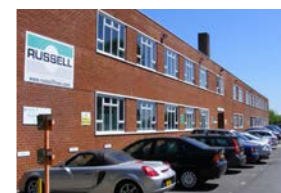
Russell Finex Ltd. Feltham, England.

Russell Finex Limited. Russell House, Browells Lane, Feltham, Middlesex TW13 7EW, England. Tel: +44 (0) 20 8818 2000 Fax: +44 (0) 20 8818 2060 Email: sales@russellfinex.com