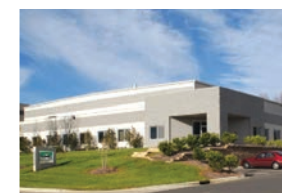
Russell Finex Inc. Pineville, N.C. USA.

Russell Finex N.V. Zandvoortstraat 20 Industriepark Noord C20 B-2800 Mechelen, Belgium. Tel: +32 (0) 15 27 59 19 Fax: +32 (0) 15 21 93 35 Email: info@russellfinex.be